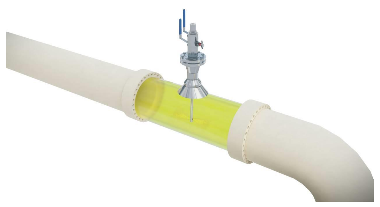
Picture 5: The system can also be used as a sampling valve by redesigning the probe and without the integrated check valve.